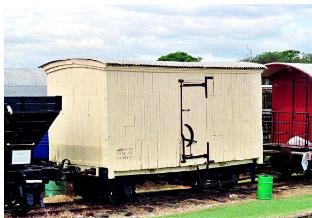
Many variants existed, here a Q.R. ABG Class Wagon has a single door.