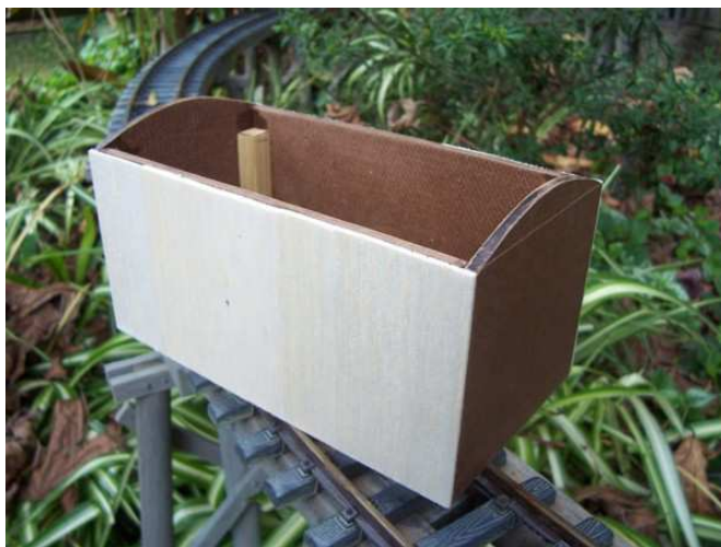
A plywood box was covered in 1.6mm Balsa. The Balsa is then scribed to resemble vertical boards.