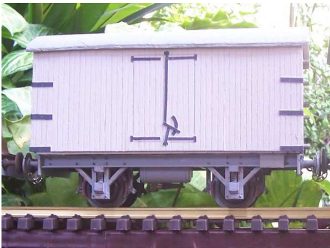
AR wagons had insulated cladding & double doors.